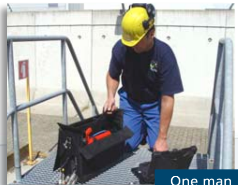
One man operation